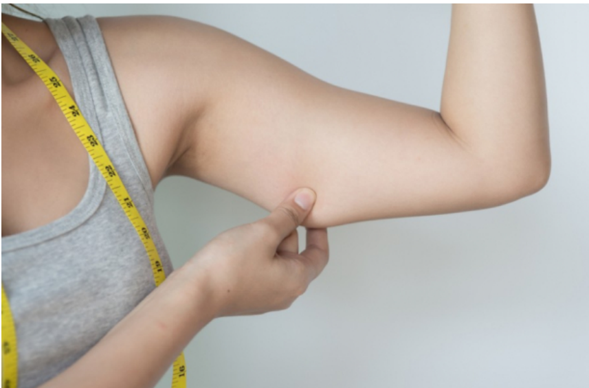
The study found that a third of young women are affected by male evaluation of their bodies

More than 70 per cent of young women in Hong Kong think they are too fat, according to a survey conducted by a youth policy think tank.